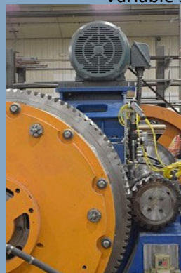
Double Helical Gear